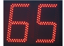
Digits with 250 mm figure height