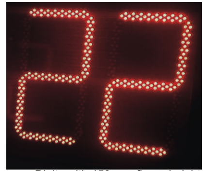
Digits with 450 mm figure height