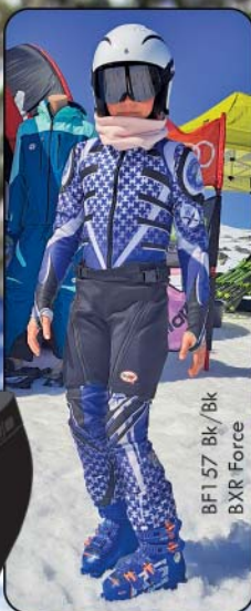
BF157 Bk/Bk BXR Force

B299 Suspenders Fits all our shorts (optional).