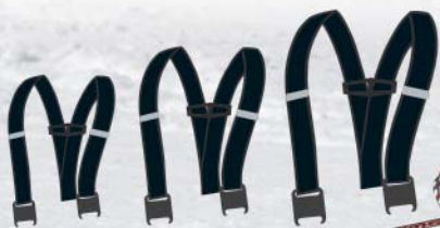
B299 - "Add on" suspenders