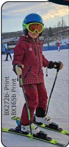
BX272b- Print BX165b Print

sible. We can offer this, because we own our own factory, where no one else sets limitations. This is something very unique!