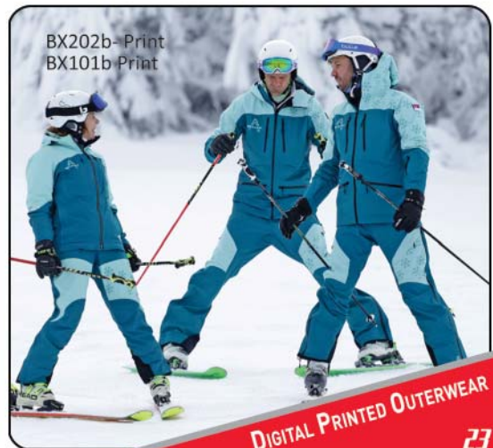
BX202b- Print BX101b Print