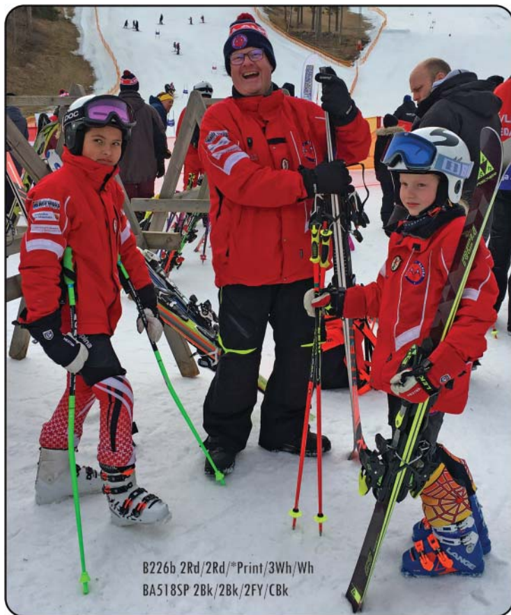
B226b 2Rd/2Rd/*Print/3Wh/Wh BA518SP 2Bk/2Bk/2FY/CBk