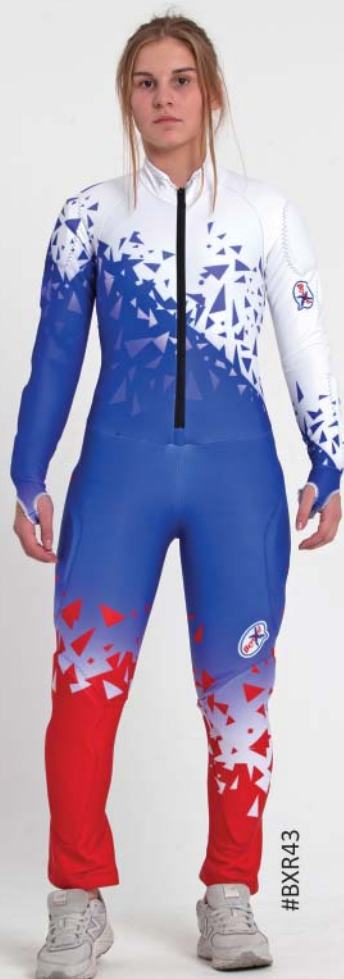
Readymade print design.