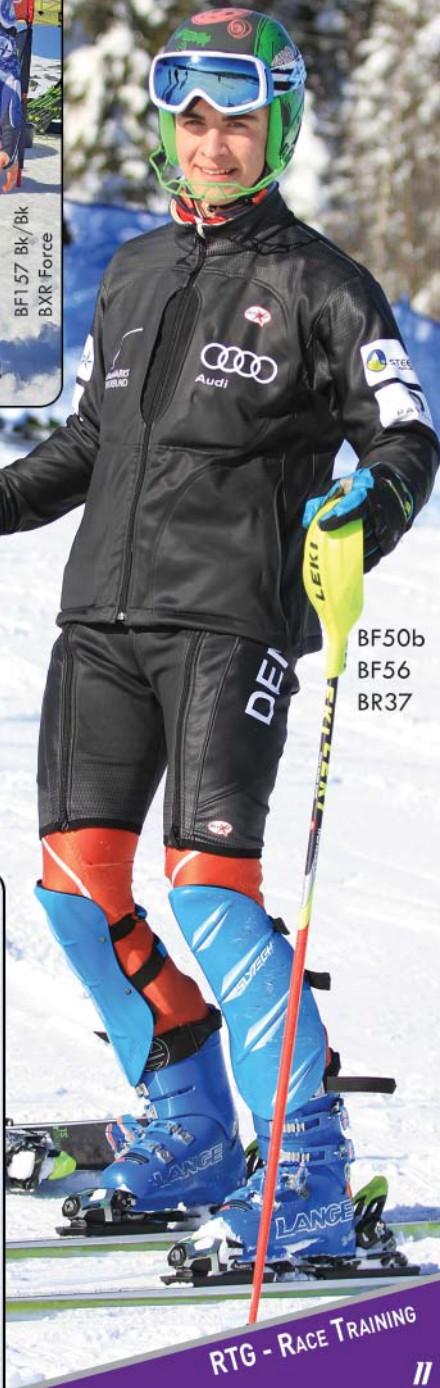
BF50b BF56 BR37