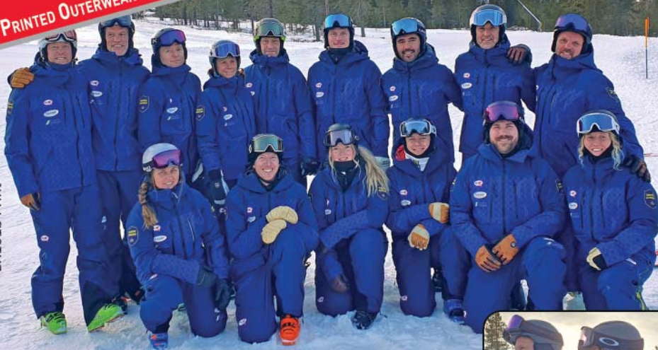
BX201b Print BX101b Print

Garments on this page spread is similar to previous spread. But jackets are somewhat longer and narrower, and includes a permanent hood.