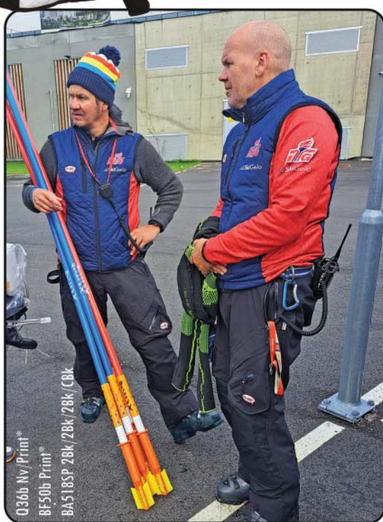
Q30b Nv/Print* BF50b Print* BA518SP 2Bk/2Bk/2Bk/CBk