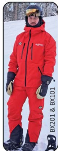
BX201 &amp; BX101