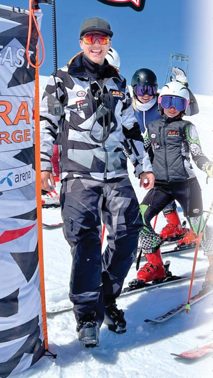
B628b- Print. BA518b Print/2Bk/2Bk/CBk.

Individually fully printed ski jackets and pants. A development sprung from years of experience in digitally printing race bibs, gate panels and race suits.