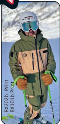
BX202b- Print BX101b Print