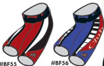
#BF55 BF55 RTG SoftShell Shorts with a tight fit. Full leg-zip and a waist belt. Sizes: XXS-XXL.

BF157 RTG SoftShell Shorts with a tight fit. Full leg-zip and a waist belt. Sizes: XXS-XXL.