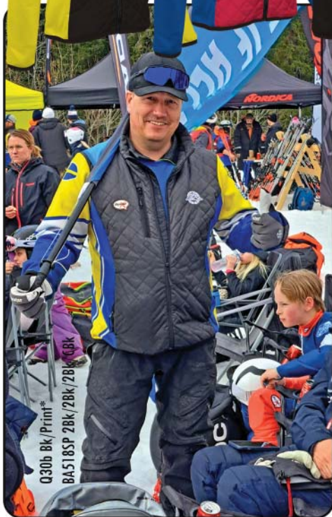
Q30b Bk/FY BA518SP 2Bk/2Bk/2Bk/CBk