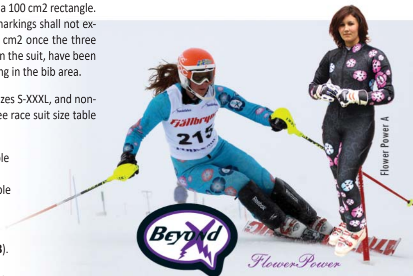
Flower Power A

BR45 Non-FIS DH suit (also available in SlimFit cut BR245 ).