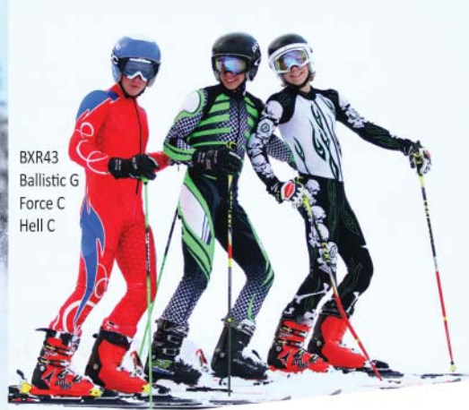
BXR43 Ballistic G Force C Hell C

For FIS suits, FIS advertising rules must be considered. No single sponsor logo shall exceed 100 cm 2 . The logo must fit inside a 100 cm 2 rectangle. Total surface of all sponsor markings shall not exceed 450 cm 2 . Remains 370 cm 2 once the three mandatory Beyond-X logos on the suit, have been deducted. No sponsor marking in the bib area.