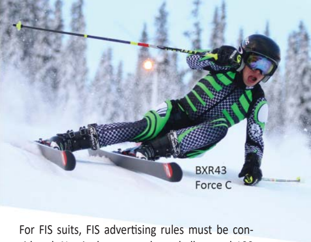
BXR43 Force C